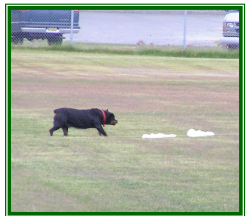
Phoenix Lure Coursing, July '09 Owned by Cheri Hagen