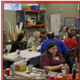
More Christmas Party Pics!

Author bio, illustrations, photos: http://www.thedogplace.org/Breeder-Exhibitor/ShowDog/Preferred-Type_Gammill-0901.asp